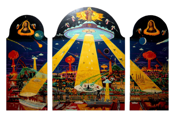
Joan Gelabert [Dalí Júnior] Tríptic de Barcelona (visió remota) (1981) Mixed media on wood 140 × 60 cm (lateral), 150 × 100 cm (central)

1 Grandas, Teresa. "Gelatina dura. Historias escamoteadas de los 80". Barcelona: MACBA (11/ 2016 - 3/2017), p. 31 [exh. cat.]