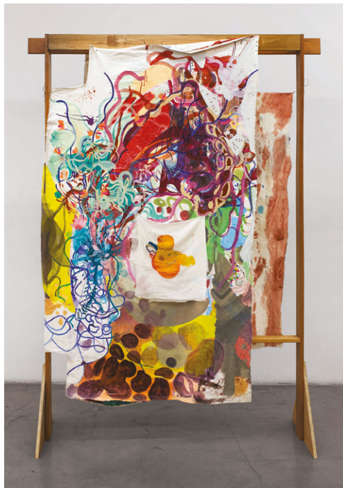
Yamulemau y Yambeque [in the image Yamulemau ] 2023-24 240 x 120 cm Latex acrylic, appliqués and embroidery on canvas and pencil on paper prepared with endured on wooden structure