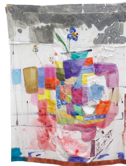
Para el Son y la Salsa, que son fuente de mi alegría Acrylic and embroidery on cotton canvas